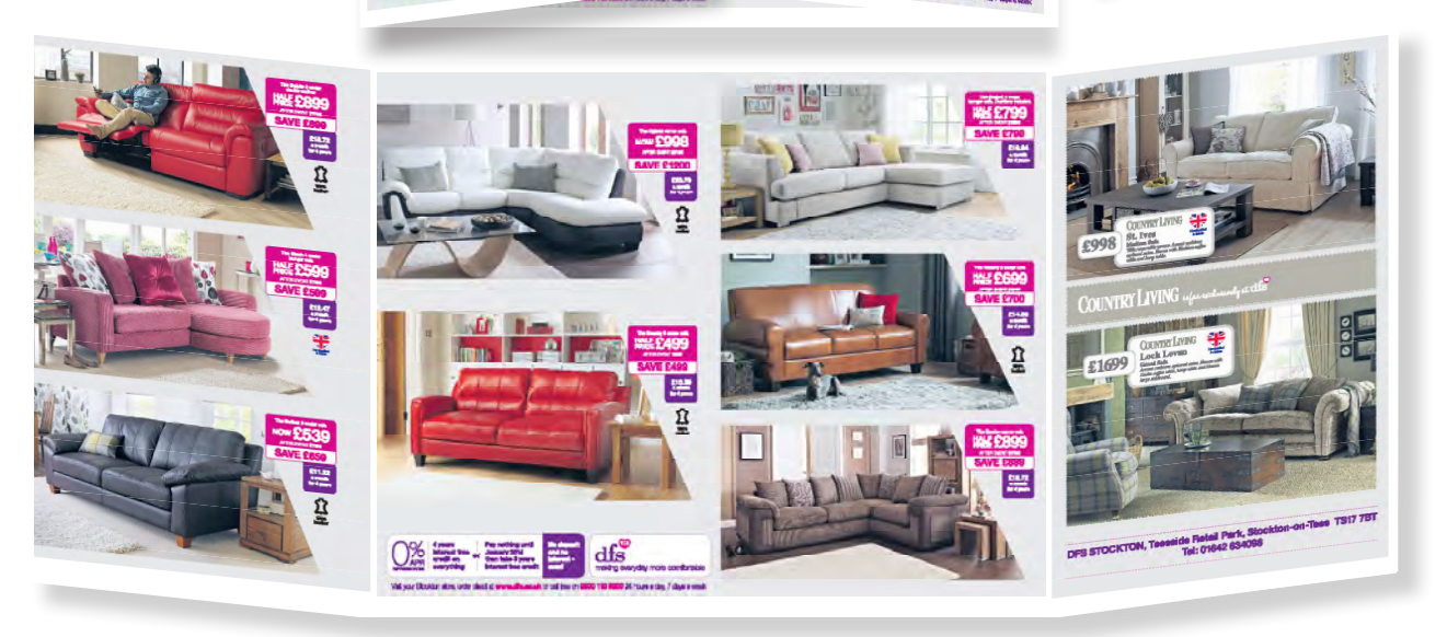
Inside Far Left Flap